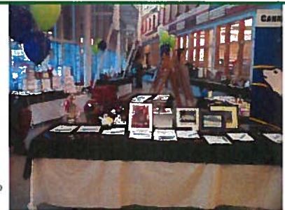
Silent Auction Area—thank once again to all our donors.