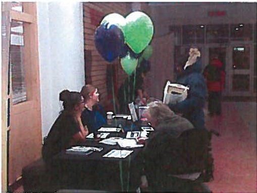
Registration Table & Membership Raffle for 2 Tickets on Canadian North Yellowknife—Edmonton