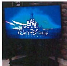
55 inch 3D TV courtesy of Roy's Audiotronic