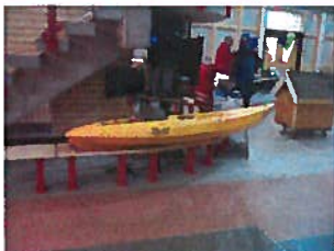
Kayak donated by Overlander Sports & Hand Made Dog House from Kimberlite Technical Center