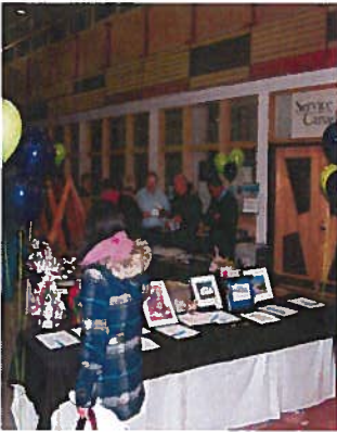
The Bidding begins!